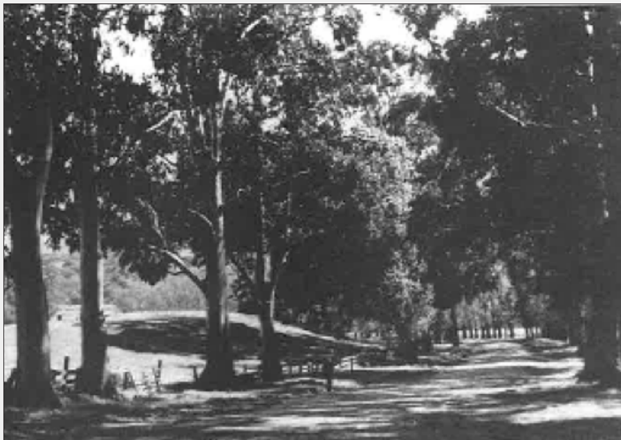
A 1930 picture of Butterfield Road, looking south, near today's Van Winkle Road.

Just how old are the trees on Butterfield Road? Some are likely 133-years-old. In 1876, Peter K. Austin purchased the valley that includes Sleepy Hollow. He had a vision of a very large hotel in an "enchanted vale" to be built besides a sulphur spring running off Loma Alta. He also envisioned a golf course and large lake. To get started, he laid out a grand, 66-foot wide avenue on the dirt boulevard of Butterfield Road and planted saplings of Lombardy poplars and eucalyptus trees to border the road. Alas, he had to abandon his vision due to foreclosure. Some of the trees we still see along Butterfield were planted in 1878. Eucalyptus trees can live for 400 years and likely will outlast many of our visions.