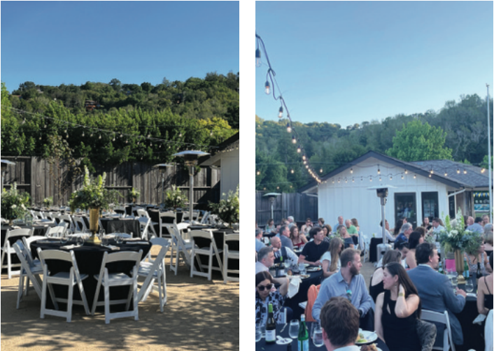
Here are some images from last year’s festivities. It was a wonderful event and the 2024 edition promises to be even bigger and better. Sign up now to enjoy the fun and we’ll see you at the Gala!