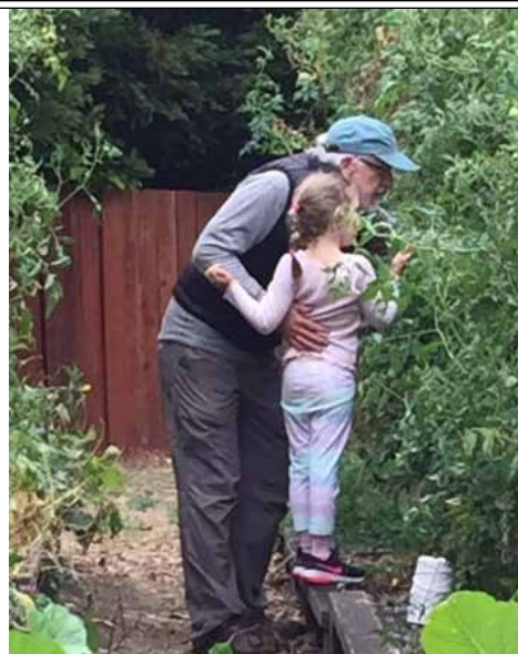
Above: Justice Garden teaches children to care for the planet and to eat healthfully.