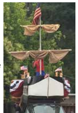
USS Constitution – 4th of July Float