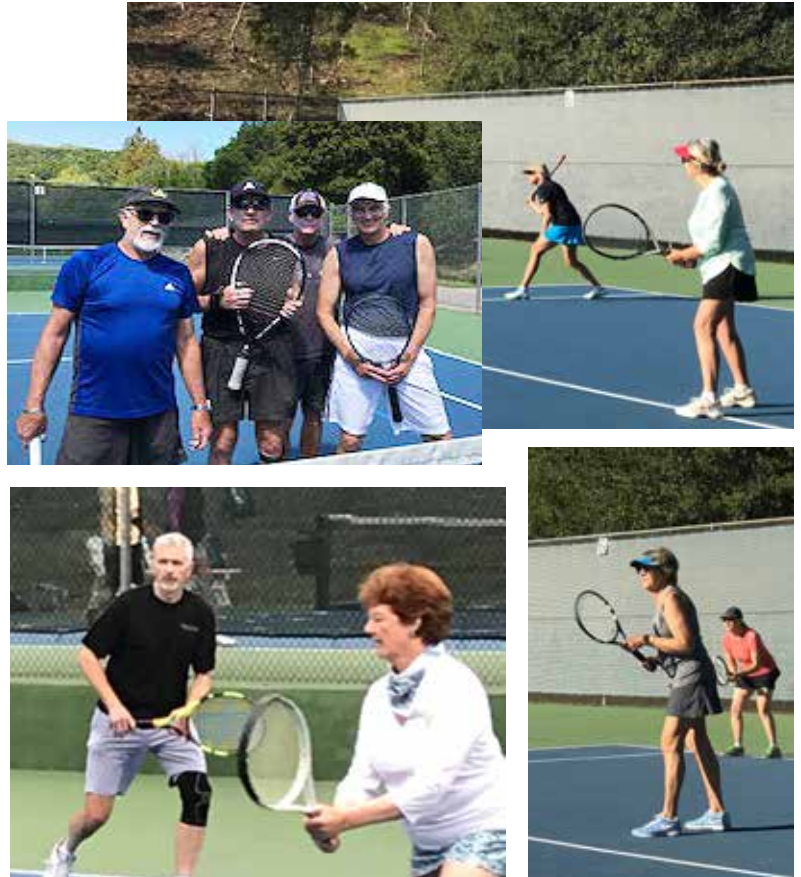
SHTC members enjoying weekend drop-in tennis play.