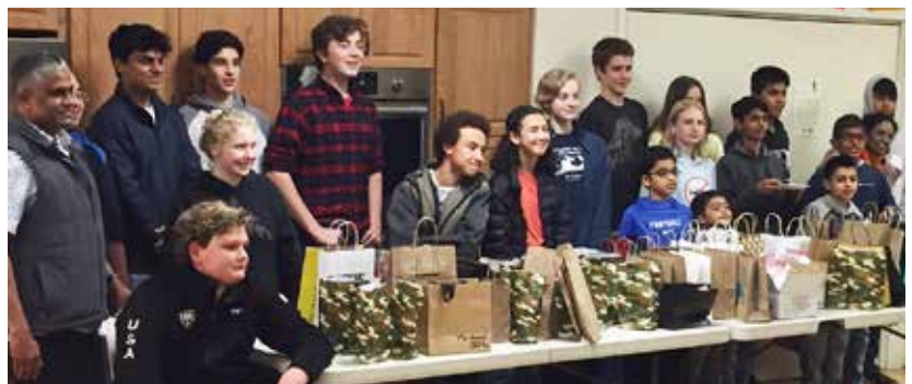
Youth from SHPC and the North Marin Islamic Center join in making toiletry kits for the unhoused.