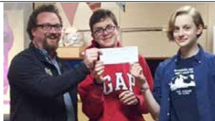
These three photos are of activities held before the Corona virus shutdown: Youth group presents check from bake sale to Downtown Streets Team.