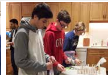
SHPC youth host the North Marin Islamic Center for an evening of service and fun.