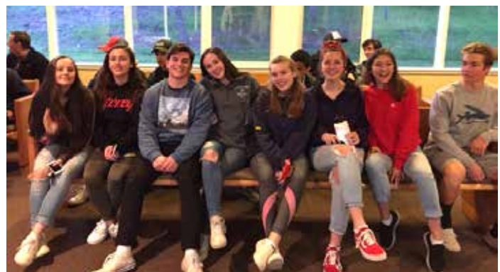
Mexico Mission Team 2018