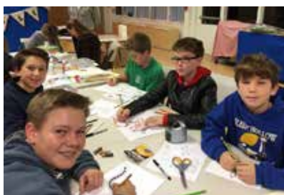
Christmas 2016 Window Art: Our youth artists, top right, above left, fill the Peaceful Kingdom of our Advent Window with creatures above right.