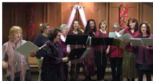
Above: Singers perform on Christmas Eve.

All welcome every Sunday morning at 9:30 a.m. for inspiration, music, friendship, co-creating a better world for all our kids. Singers rehearse Wednesdays at 7:30 p.m. - New singers welcome!